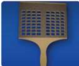
UNI Series Double Paddle Item #1410