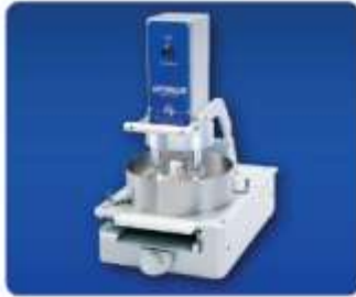
AutoFiller - Item #3500