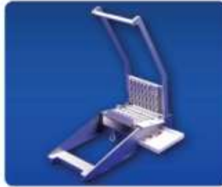
Deblisterer - Item #1110