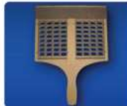
UD Double Paddle Item #UD410

62 and 90 count versions also available. To see a full assortment of paddles, visit our website @ www.rxsystems.com/Products/Equipment/MedicationPackaging/SealingAccessories.aspx