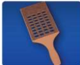
UNI Series Single Paddle Item #1404