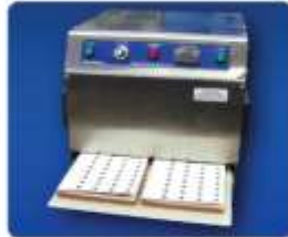
Pressure Board - Item #1047