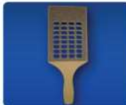
M Series Single Paddle Item #M400