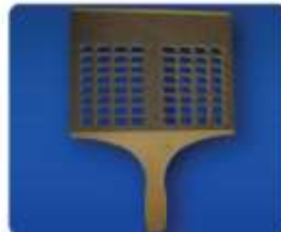
M Series Double Paddle Item #M410