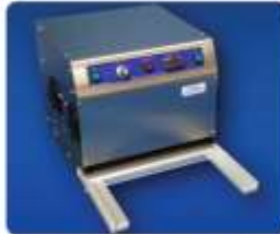
Slide Rails - Item #1000R